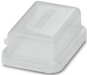
Protective covers, type: B6, degree of protection: IP20, color: transparent/white

Please be informed that the data shown in this PDF Document is generated from our Online Catalog. Please find the complete data in the user's documentation. Our General Terms of Use for Downloads are valid ( http://phoenixcontact.com/download )