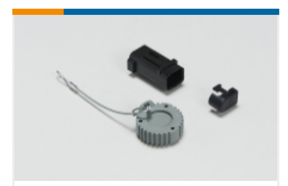
Automotive Connector Caps & Covers