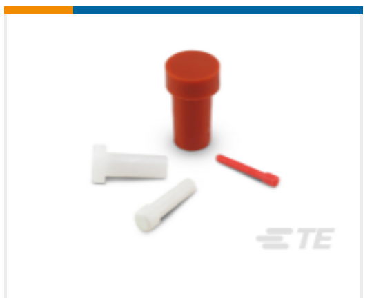
TE Part # CAT-D48-SP729 DEUTSCH Sealing Plugs