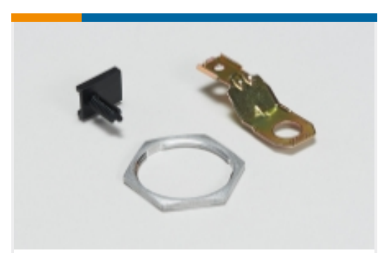
Other Automotive Connector Accessories(16)