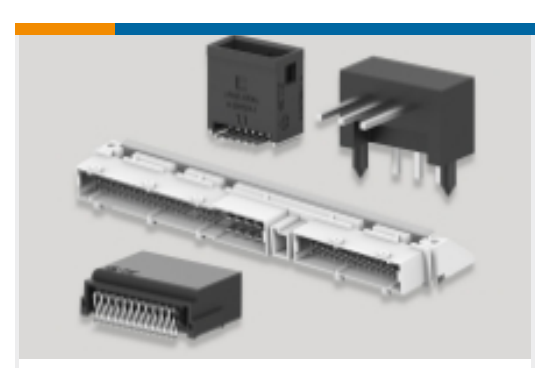
PCB Headers & Receptacles(102)