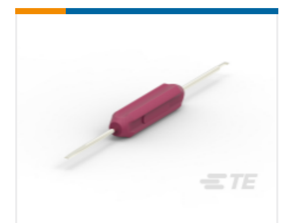
TE Part # DT-RT1 EXT TOOL, FRONT RELEASE