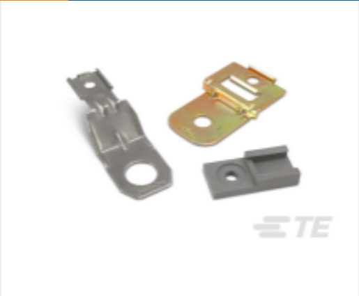
TE Part # CAT-D487-M8649 DEUTSCH DT Mounting Clips