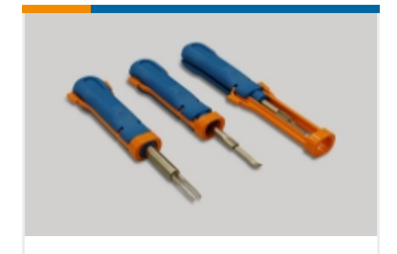
Insertion & Extraction Tools(3)