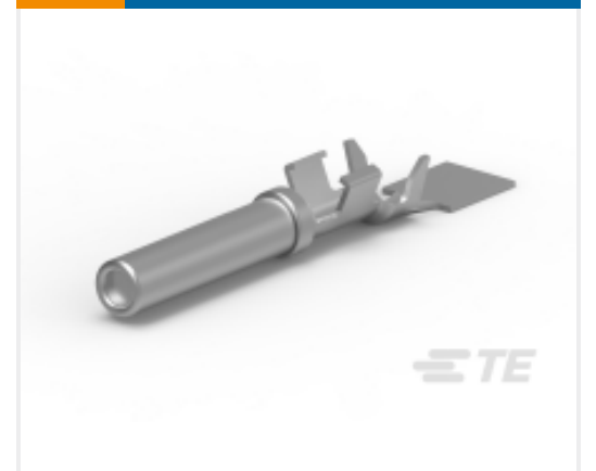
TE Part # CAT-J67-DSCC16 DEUTSCH Size 16 Crimp Contacts