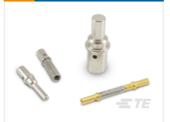
TE Part # CAT-D48-ST273 DEUTSCH Solid Contacts