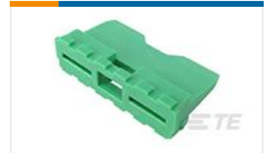
TE Part # W12P WEDGE LOCK, 12P, REC, GRN, DT