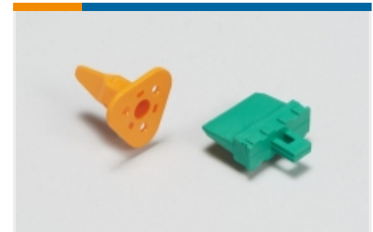
Automotive Connector Locks & Position Assurance(74)