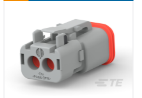
TE Part # CAT-J41-DDPC DEUTSCH DT Plug Connectors