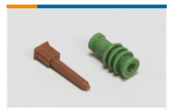
Automotive Seals & Cavity Plugs(6)