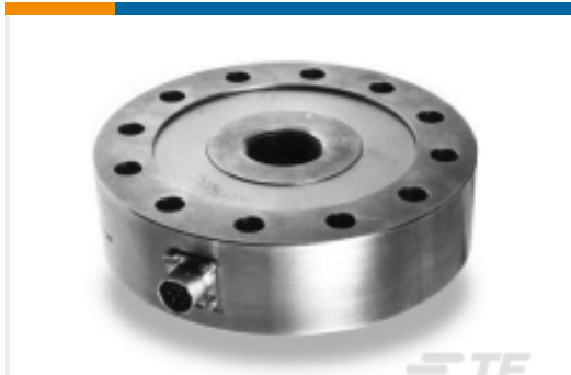
TE Part #20018780-00 Load Cell up to 200,000 Lb, FN3000