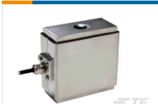
TE Part #EFN31-100N-C20005 FN3148-100N-/SC