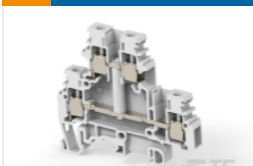
TE Part #1SNA115166R1100 M4/6.D1