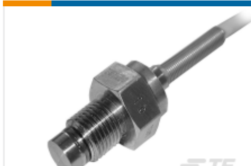
TE Part #EXPC1-200BS-C00003 XPC10-M-200BS