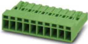
The illustration shows a 15-position version

Plug component, Nominal current: 12 A, Rated voltage (III/2): 320 V, Number of positions: 7, Pitch: 5.08 mm, Connection method: Crimp connection, Color: green, Corresponding female crimp contacts with current [A] and conductor cross section range [mm 2 ] data: 10A/MSTBC-MT 0,5-1,0 (3190564); 10A/MSTBC-MT 0,5-1,0 BA (3190645); 12A/MSTBC-MT 1,5-2,5 (3190551); 12A/MSTBC-MT 1,5-2,5 BA (3190658). BA = Bandkontakte