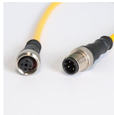
Male and Female 4-pole