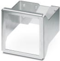
DIN rail adapter for EEM-MA600 and EEM-MA400 energy meters

Please be informed that the data shown in this PDF Document is generated from our Online Catalog. Please find the complete data in the user's documentation. Our General Terms of Use for Downloads are valid ( http://phoenixcontact.com/download )