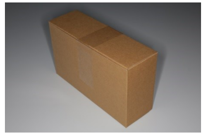
Old cardboard box

New cardboard box with compartments, new outer dimensions 385x285x55mm.