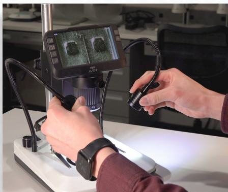
Two 14.5" Flexible Goosenecks w/ Adjustable LEDs