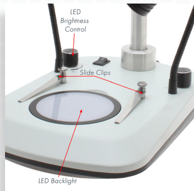
Adjustable LED Back Light