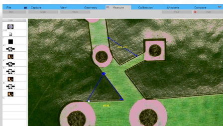
ezImageX3 Download Included