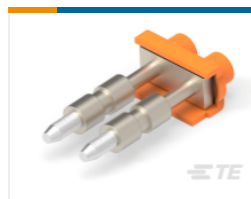
TE Part #1SNK908902R0000 JB8-2-R1