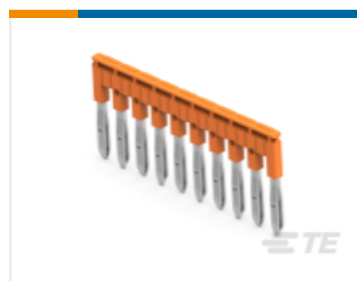
TE Part #1SNK906310R0000 JB6-10