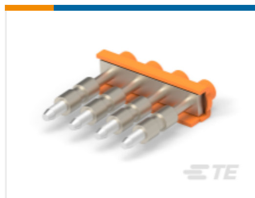
TE Part #1SNK908904R0000 JB8-4-R1