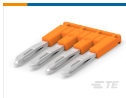
TE Part #1SNK906304R0000 JB6-4