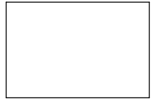
REFERENCE VIEW Scale: 2:1