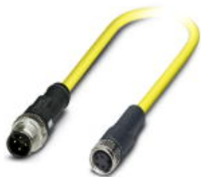
Sensor/actuator cable, 4-position, PVC, yellow, Plug straight M12 SPEEDCON, A-coded, on Socket straight M8, cable length: 0.5 m

Please be informed that the data shown in this PDF Document is generated from our Online Catalog. Please find the complete data in the user's documentation. Our General Terms of Use for Downloads are valid ( http://phoenixcontact.com/download )