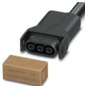
SUNCLIX micon mains connector for the plug side, 3-pos., IP67, 20 A, 600 V, trunk line: 1.0 m, incl. dust protection cap, North American version

Please be informed that the data shown in this PDF Document is generated from our Online Catalog. Please find the complete data in the user's documentation. Our General Terms of Use for Downloads are valid ( http://phoenixcontact.com/download )