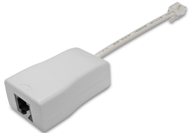
Z-330PJ xDSL over POTS CPE In-Line Filter