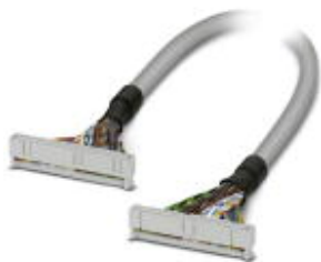
Round cable set; connection 1: IDC/FLK socket strip (1x 34-position); connection 2: IDC/FLK socket strip (1x 34-position); cable length: 3 m

Please be informed that the data shown in this PDF Document is generated from our Online Catalog. Please find the complete data in the user's documentation. Our General Terms of Use for Downloads are valid ( http://phoenixcontact.com/download )