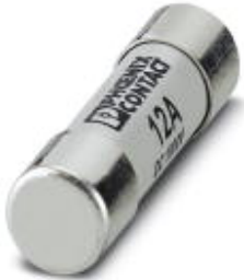
Fuse, 10.3x38 mm, up to 1000 V DC, gPV characteristics

Please be informed that the data shown in this PDF Document is generated from our Online Catalog. Please find the complete data in the user's documentation. Our General Terms of Use for Downloads are valid ( http://phoenixcontact.com/download )