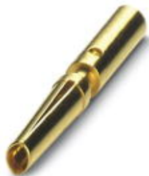
Crimp contact, turned, contact diameter: 0.8 mm, crimp range: 0.08 mm 2 ... 0.25 mm 2

Please be informed that the data shown in this PDF Document is generated from our Online Catalog. Please find the complete data in the user's documentation. Our General Terms of Use for Downloads are valid ( http://phoenixcontact.com/download )