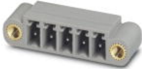
The figure shows the 5-pos. version of the product in gray

Header, Nominal current: 8 A, Rated voltage (III/2): 160 V, Number of positions: 11, Pitch: 3.81 mm, Color: black, Contact surface: Tin, Mounting: Wave soldering