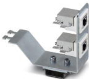
Patch field with two RJ45 CAT6 network connections

Please be informed that the data shown in this PDF Document is generated from our Online Catalog. Please find the complete data in the user's documentation. Our General Terms of Use for Downloads are valid ( http://phoenixcontact.com/download )