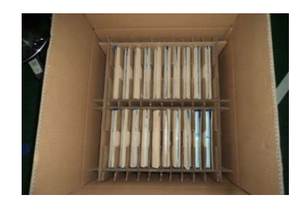
Fig. 2: New: 20pcs (two rows x 10pcs), 13.5kg

We implemented following test to verify the effect of the change.