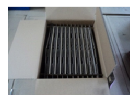
Fig. 1: Current: 10pcs (1rowx10pcs), 11kg