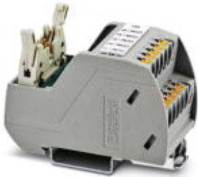
VARIOFACE Professional (VIP) board for the ROC800 controller

Please be informed that the data shown in this PDF Document is generated from our Online Catalog. Please find the complete data in the user's documentation. Our General Terms of Use for Downloads are valid ( http://phoenixcontact.com/download )