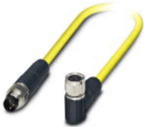
Sensor/actuator cable, 3-position, PVC, yellow, shielded, Plug straight M8, on Socket angled M8, cable length: 0.5 m

Please be informed that the data shown in this PDF Document is generated from our Online Catalog. Please find the complete data in the user's documentation. Our General Terms of Use for Downloads are valid ( http://phoenixcontact.com/download )