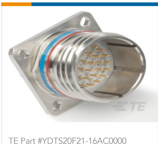
TE Part #YDTS20F21-16AC0000 SQUARE FLANGE RECEPTACLE