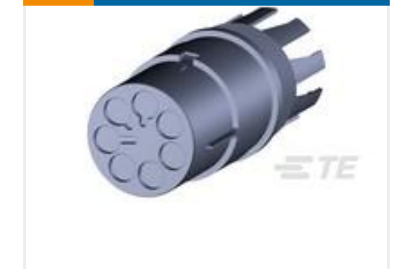
TE Part #293722-1 NECTOR M PIN HSG FREE HANGING 7P CODE A