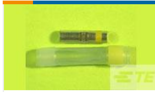
TE Part #650128-000 D-436-84