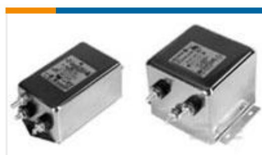
TE Part #1-6609036-6 40VSK6=F7775 S0