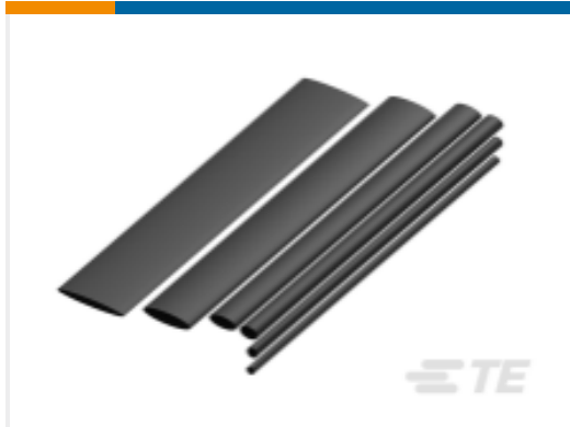
TE Part #NB17224001 RNF-150-1-0-SP