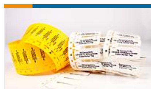
TE Part #768838-000 CM-SCE-TP-1/4-4H-9