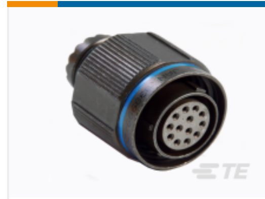
TE Part #YDTS26F13-98PNV001 PLUG ASSY