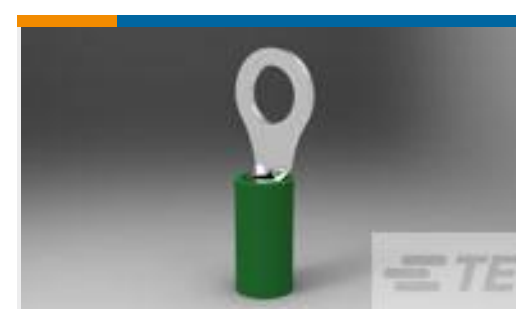
TE Part #50832-1 TERMINAL,PIDG PTFE R 22-20 10