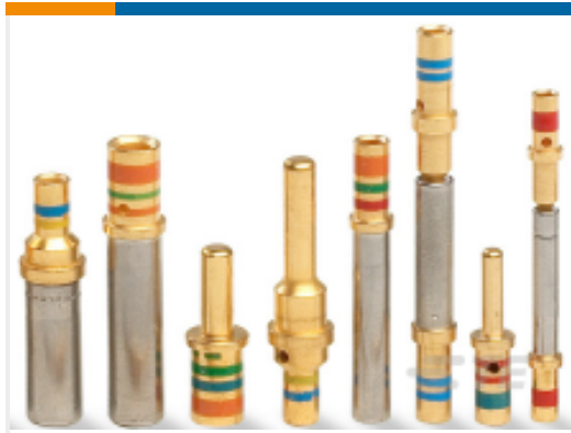
TE Part #4109-207-2000L CONT SOC ASSY