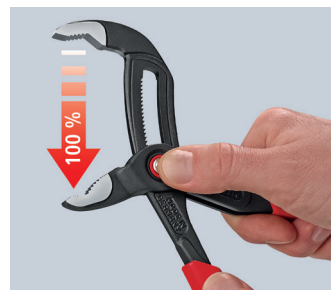
Press the button – open pliers completely