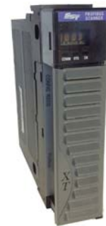
CLXT Communication Module 112016-0024 (SST-PB3-CLXT-RLL)