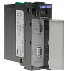
Communication Module 112016-0018 (SST-PB3-CLX-RLL)