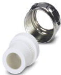
Half screw connection Pg16, made of metal, consisting of rubber seal with one hole and one pressure screw, for type 1 housings, cable [mm] 11.5 - 15.5

Please be informed that the data shown in this PDF Document is generated from our Online Catalog. Please find the complete data in the user's documentation. Our General Terms of Use for Downloads are valid ( http://phoenixcontact.com/download )