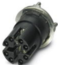
Cat6 A flush-type socket, Ethernet, 8-pos., rear mounting, with straight solder connection

Please be informed that the data shown in this PDF Document is generated from our Online Catalog. Please find the complete data in the user's documentation. Our General Terms of Use for Downloads are valid ( http://phoenixcontact.com/download )