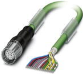
Cable plug in molded plastic, Length: 5 m, Color of outer sheath: green

Please be informed that the data shown in this PDF Document is generated from our Online Catalog. Please find the complete data in the user's documentation. Our General Terms of Use for Downloads are valid ( http://phoenixcontact.com/download )