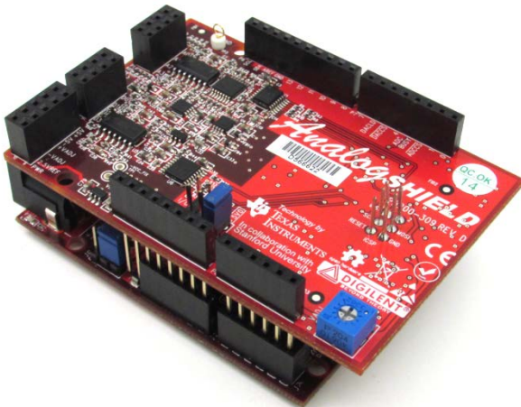
Figure 1. The Analog Shield.

The Analog Shield offers a high fidelity and easy way to connect your Arduino™ or chipKIT™ to analog circuits. In order to do this, the Digilent Analog Shield* provides: