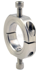
*Additional hardware NOT included