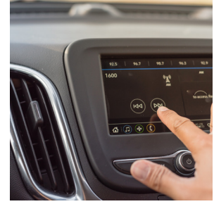
Audio Display Equipment