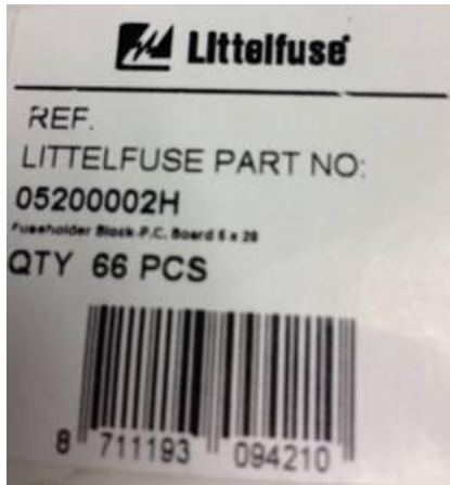
Current part (4.5 cm x 4.5 cm)