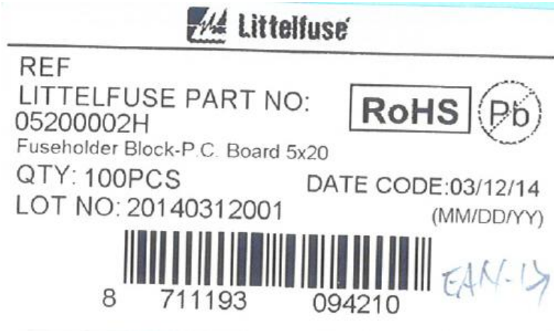
New part (6 cm x 3.5cm)

The format and size for the packaging label will be slightly different. (bar code EAN-13 code format)