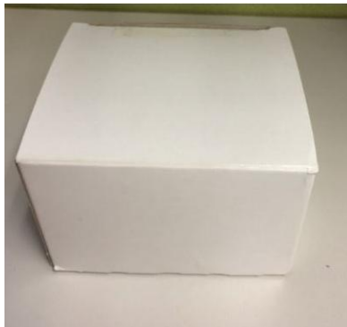
Current dimension 9.5cm(L) x 8.5cm(W) x 6.0cm(H)

The format and size for the packaging label will be slightly different. (bar code EAN-13 code format)