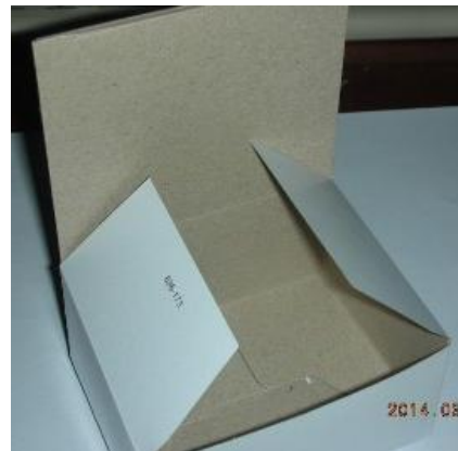
New dimension 9.2cm(L) x 7.5cm(W) x 4.4cm(H)