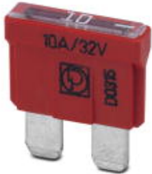
Flat-type plug-in fuse, type C, color code: red, nominal current: 10 A

Please be informed that the data shown in this PDF Document is generated from our Online Catalog. Please find the complete data in the user's documentation. Our General Terms of Use for Downloads are valid ( http://phoenixcontact.com/download )