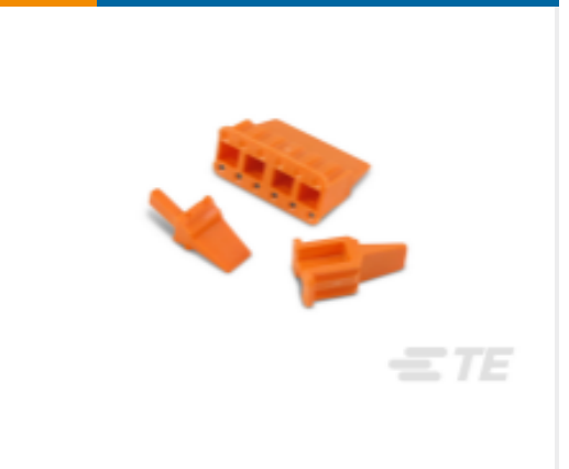
TE Part #WM-4P DEUTSCH DTM Wedgelocks