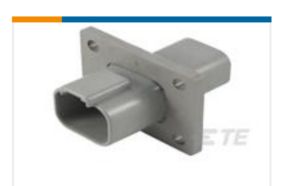
TE Part #DT04-4P-CL03 REC, 4P, GRY, E, FLANGE