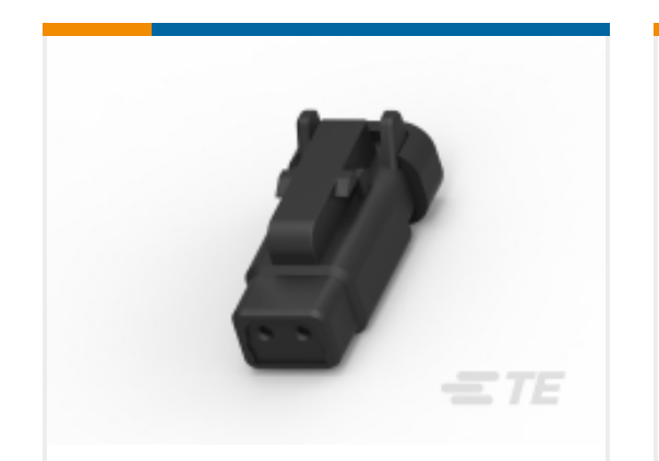
TE Part #DTM06-2S-P006 PLG, 2P, GRY, 120 OHM RESISTOR, AU, A