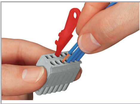
Conductor termination parallel to CAGE CLAMP® actuation

Subject to changes. Please also observe the further product documentation!