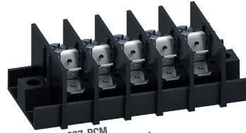
Series 307-PCM Screw connection and tab in 0°, 45° and 90° design