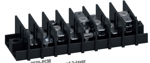
Series 3070-PCM Configurations with 2- and 3-layer tabs and SAK screw connection