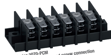
Series 3070-PCM 3-layer tab 4.8 mm and screw connection