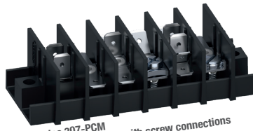
Series 307-PCM Different assembly with screw connections