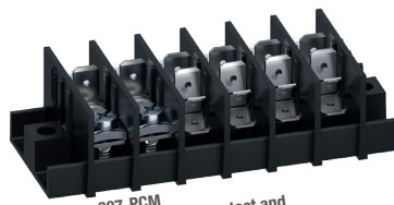
Series 307-PCM Assembly with screw contact and 6 contact tab configuration