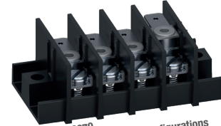
Series 3070 With two different tab configurations and SAK screw connection