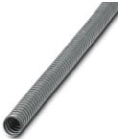
Protective hose in galvanized steel

Please be informed that the data shown in this PDF Document is generated from our Online Catalog. Please find the complete data in the user's documentation. Our General Terms of Use for Downloads are valid ( http://phoenixcontact.com/download )