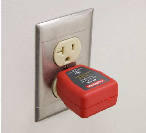
Plug the transmitter into an outlet and receiver will find the corresponding breaker.