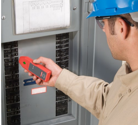
The receiver always finds the right breaker - automatic sensitivity adjustment removes ambiguity from the search by indicating single, correct breaker with light and sound.