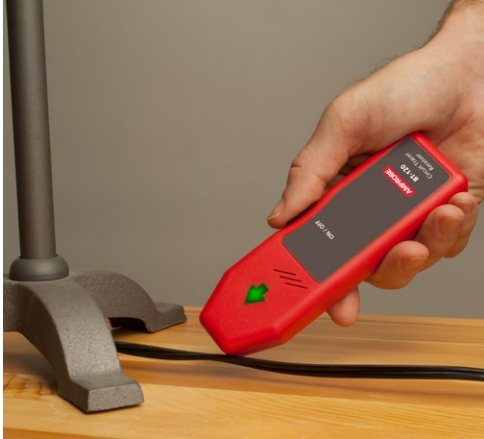
Designed for use in residential and light commercial environments.