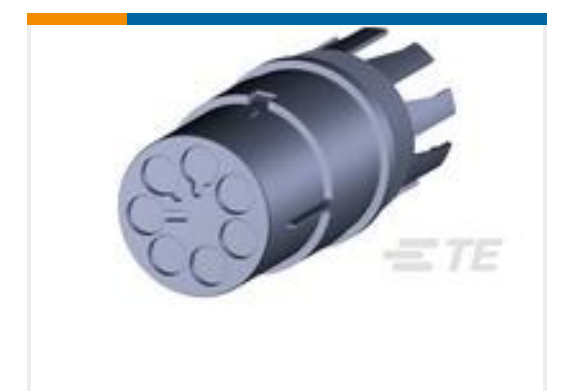
TE Part #293722-1 NECTOR M PIN HSG FREE HANGING 7P CODE A