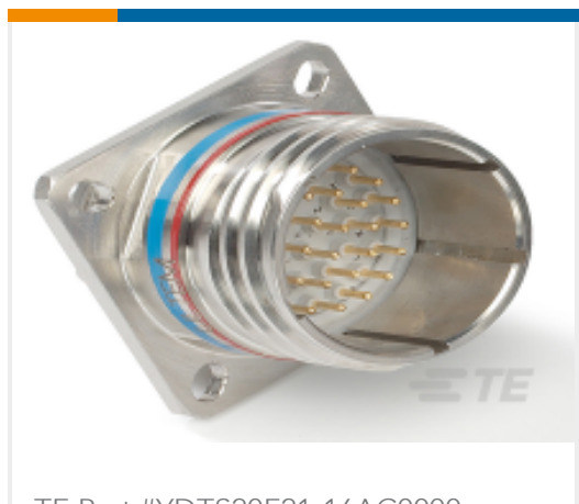
TE Part #YDTS20F21-16AC0000 SQUARE FLANGE RECEPTACLE