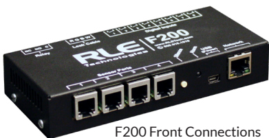
F200 Front Connections