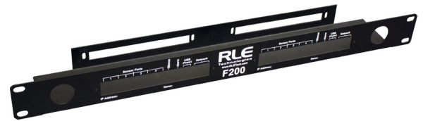
Optional Rack Mount Bracket