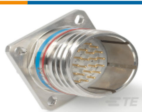
TE Part #YDTS20F21-16AC0000 SQUARE FLANGE RECEPTACLE