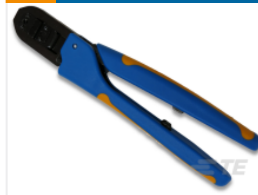
TE Part #2844982-1 CCII TYPE VI MLTIMATE PIN/SKT 22- 18 ASSY