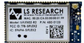
Actual size (23 mm x 41.4 mm)