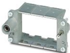
Module carrier frame, size: B10, type : for the sleeve side (A, B, C, ...) V, 4 mm 2 ... 6 mm 2 , application: Module carrier frame

Please be informed that the data shown in this PDF Document is generated from our Online Catalog. Please find the complete data in the user's documentation. Our General Terms of Use for Downloads are valid ( http://phoenixcontact.com/download )