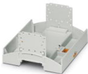
Installation component housing, Lower part, width: 107.6 mm, color: light gray (7035)

Please be informed that the data shown in this PDF Document is generated from our Online Catalog. Please find the complete data in the user's documentation. Our General Terms of Use for Downloads are valid ( http://phoenixcontact.com/download )