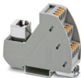
VARIOFACE module with push-in connection and RJ45 connector

Please be informed that the data shown in this PDF Document is generated from our Online Catalog. Please find the complete data in the user's documentation. Our General Terms of Use for Downloads are valid ( http://phoenixcontact.com/download )