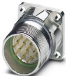
Device connector, front mounting, straight, Screw locking, M23, number of positions: 6, type of contact: Pin, Solder connection, Axial O-ring, 4x Ø 3.2, shielded: yes

Please be informed that the data shown in this PDF Document is generated from our Online Catalog. Please find the complete data in the user's documentation. Our General Terms of Use for Downloads are valid ( http://phoenixcontact.com/download )