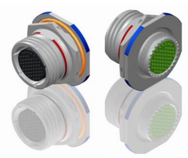
LAYOUT SHOWN AS EXAMPLE