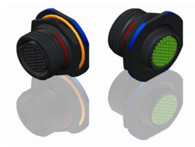
LAYOUT SHOWN AS EXAMPLE