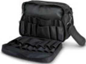
Tool bag, with document and laptop compartments, unequipped

Please be informed that the data shown in this PDF Document is generated from our Online Catalog. Please find the complete data in the user's documentation. Our General Terms of Use for Downloads are valid ( http://phoenixcontact.com/download )